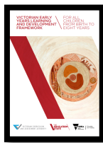
Victorian Early Years Learning and Development Framework

Approved learning framework: A document that outlines practices that educators and co-ordinators must use to support and promote children’s learning. The Early Years Learning Framework (Belonging, Being & Becoming) , the Victorian Early Years Learning and Development Framework and My Time, Our Place; Framework for School Age Care in Australia are approved learning frameworks for use in Victoria ( refer to Sources ).