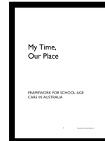
My Time, Our Place; Framework for School Age Care in Australia

Critical reflection: Reflective practices that focus on implications for equity and social justice ( Early Years Learning Framework – refer to Sources ).